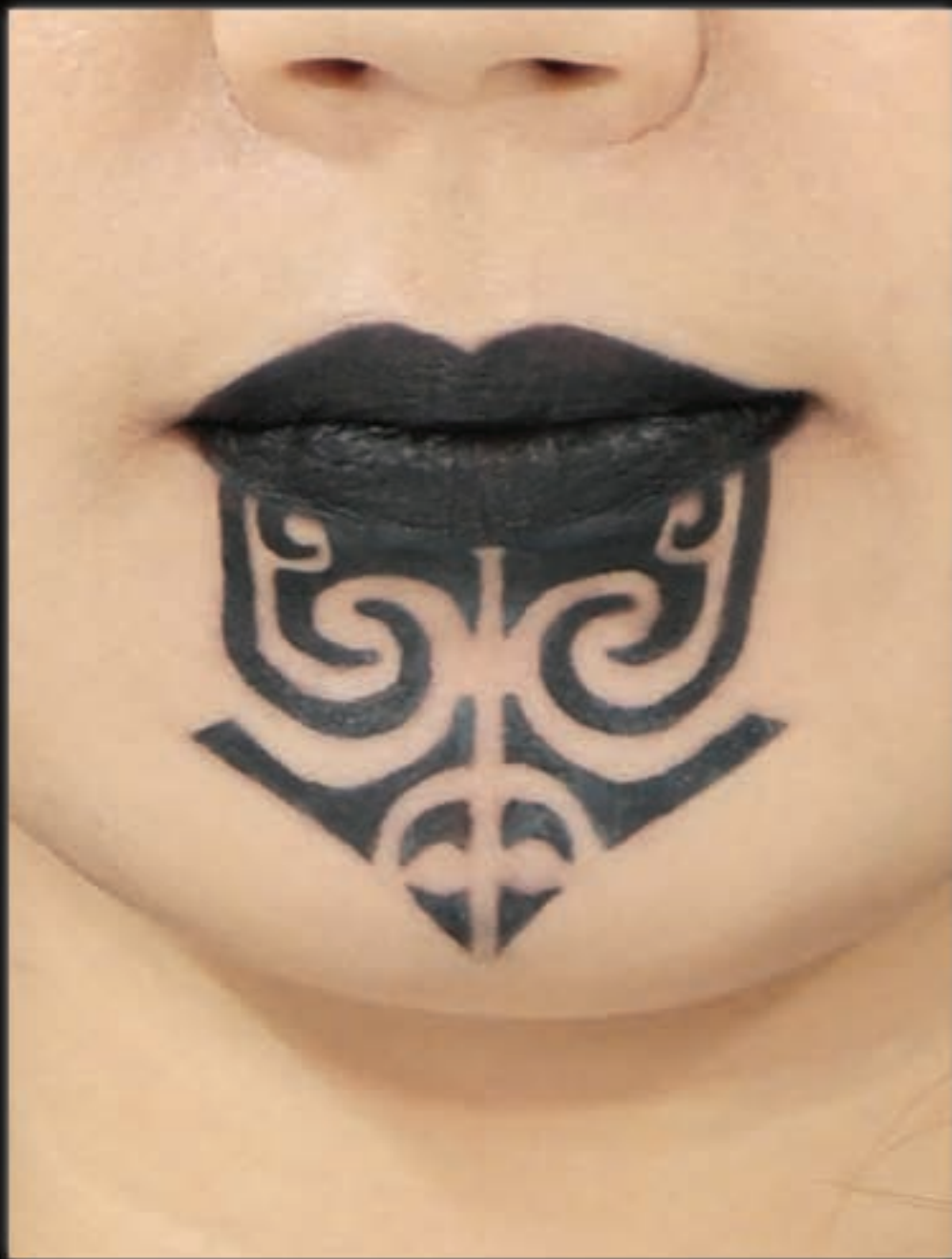
Hand Drawn Tattoo